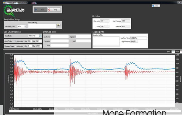
More Formation breakdown while fracking