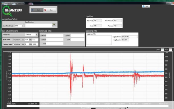
Formation breakdown while fracking