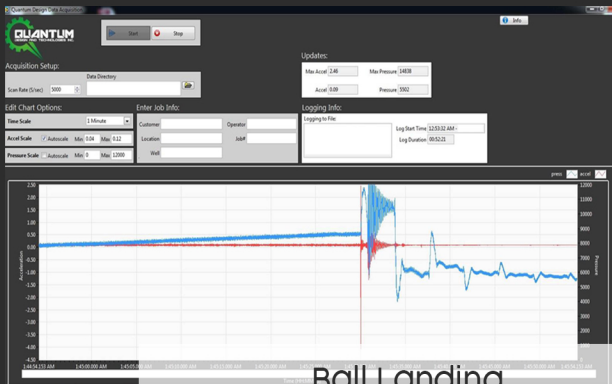
Ball Landing With No Formation Penetration